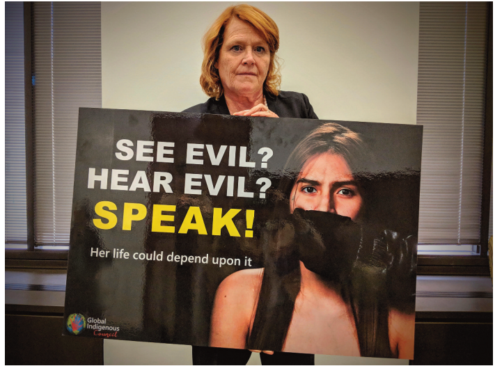
Senator Heidi Heitkamp (D-ND).